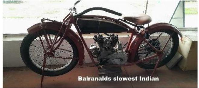
Balranalds slowest Indian